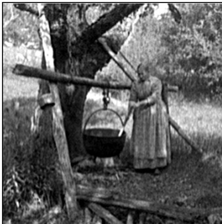
Soap Making in Henryville, Pa